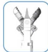
Serrated forceps with needle