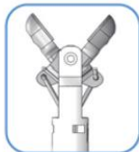
Plain cup forceps