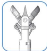
Plain cup forceps with needle